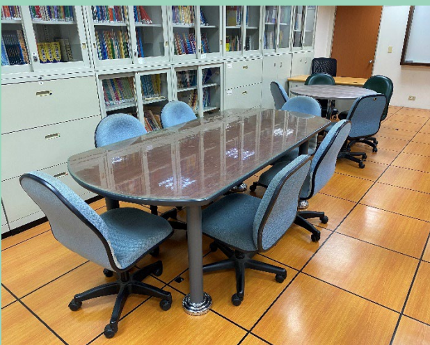
Center of Multimedia Material Design and Foreign Language Instruction