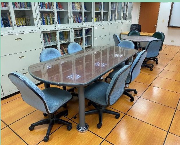
Center of Multimedia Material Design and Foreign Language Instruction