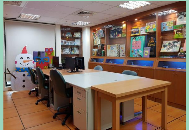
Materials production area